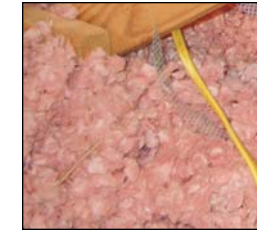
We evacuate the old insulation and re-insulate to today's building standards.

A-Plus Restorations restores your home to its A-plus condition, before the raccoons moved in and trashed the place.