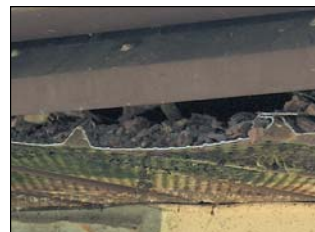
Raccoons can rip out soffits; their feces just pile up.