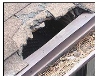
Here, the raccoons gnawed right through the roof to get in. We repair ceilings, soffits, roofing and more.

Raccoons are attracted to urban areas by the easily accessible food, water and shelter. They're climbers, capable of seizing and pushing or pulling objects with considerable force. And so, they break into your house.