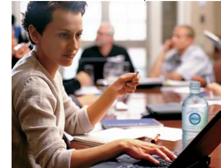
For hosting strategy sessions, sales and training meetings, caucuses, etc.

Most private label bottled water companies require you to order truckloads as a minimum, with long-term financial commitments. That's too much! Only Castle Springs welcomes