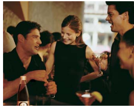
The popular mixer for restaurants, bars, hospitality suites; buffets, corporate receptions, cultural fund-raising events

It's the hassle-free way to show your logo, present your message and identify yourself.